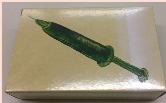
The 'Mogelpackung': instead of a syringe you find educational material inside and the provocative note that syringes are still not allowed within the prison setting. Idea and design by Deutsche AIDS-Hilfe and AIDS-Hilfe Duisburg. This item will be part of the exhibition in Schwules* Museum.